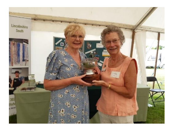
People's Choice Winner