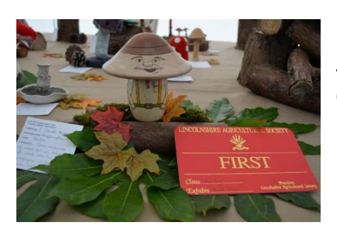
right (Rolling Scones WI)